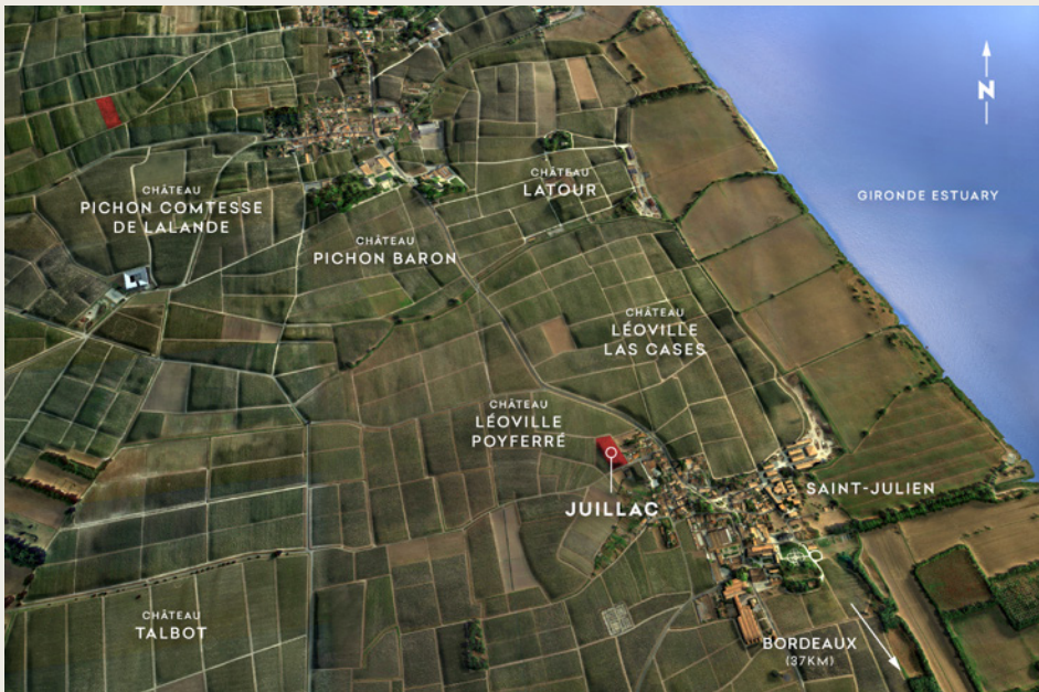
AN EXAMPLE OF WHERE ONE OF VINIV'S LEFT BANK VINEYARDS IS LOCATED. THIS IS JUILLAC, OUR CABERNET SAUVIGNON VINEYARD IN SAINT-JULIEN.

With the guidance of our winemaking team, you will quickly discover the alchemy of blending and decide which combination of plots and grape varieties best match your wine-style objectives.