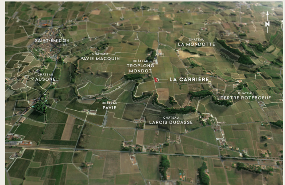
AN EXAMPLE OF WHERE ONE OF VINIV'S RIGHT BANK VINEYARDS IS LOCATED. THIS IS LA CARRIÈRE, OUR CABERNET FRANC VINEYARD IN SAINT-ÉMILION.

VINIV gives you the opportunity to go beyond the boundaries of appellation by blending wine from vineyards within the best sectors on both the Left and Right Banks. This is an essential part of your singular winemaking story.